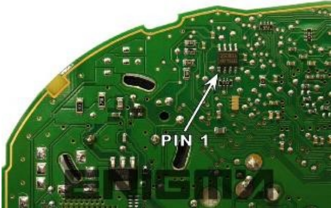
BMW 1 DASH