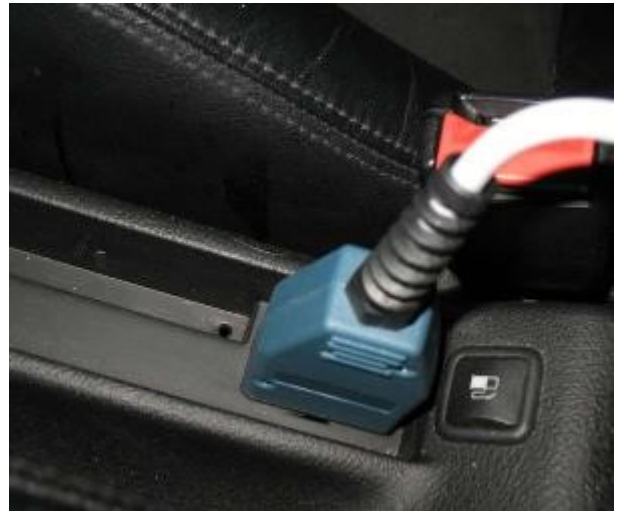
VW PASSAT B5

OBD2 – PROGRAMMING BY C1 – OBD2 DIAGNOSTIC CABLE